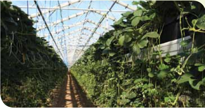
Multiple layer strawberry production.