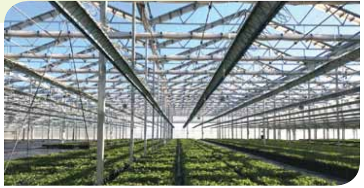
Retractable roofs can also be used to improve production of crops grown in the soil.