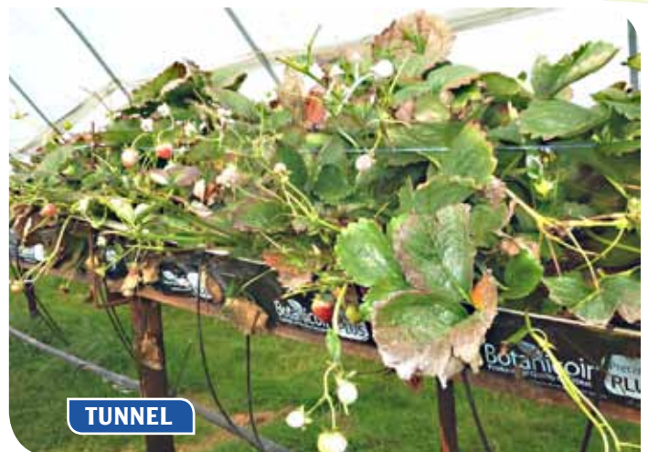
Pictures taken September 11 in the UK on the same farm. Conventional tunnel on the right and a retractable roof on the left.