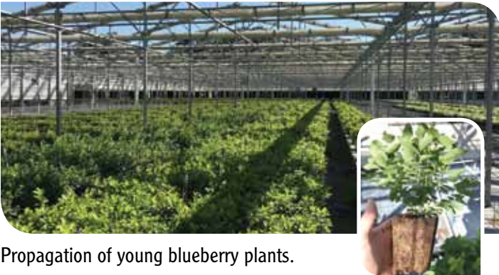
Propagation of young blueberry plants.