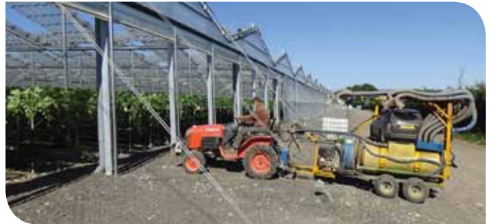
Labour costs can be reduced by incorporating motorized spray systems into the structures.

Contact Cravo if you want to see for yourself how easy it is to manage hectares of berry production more profitably using the Cravo retractable roof production system.