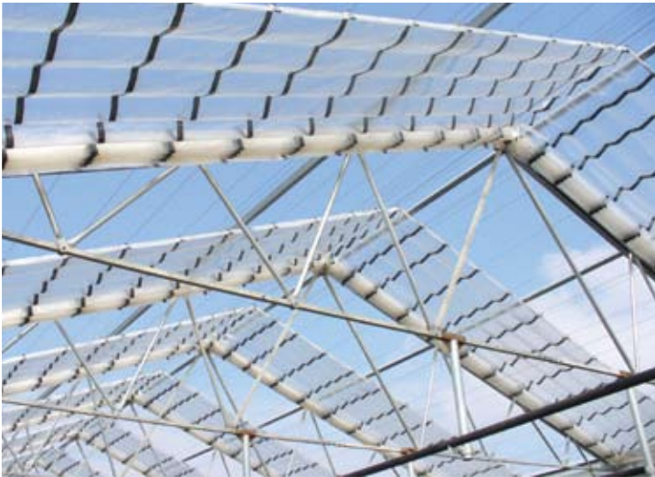
Clear RC02 woven and coated polyethylene roofs provide high light transmission when roof is closed.