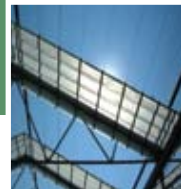
White fire retardant roof coverings meet NFPA 701. During extremely hot conditions, closing the roof 85% provides diffused light levels, and provides a comfortable shopping environment with out the need for additional shade.