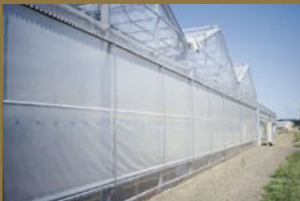
Sidewall with roll up curtain and clear polycarbonate kneewall