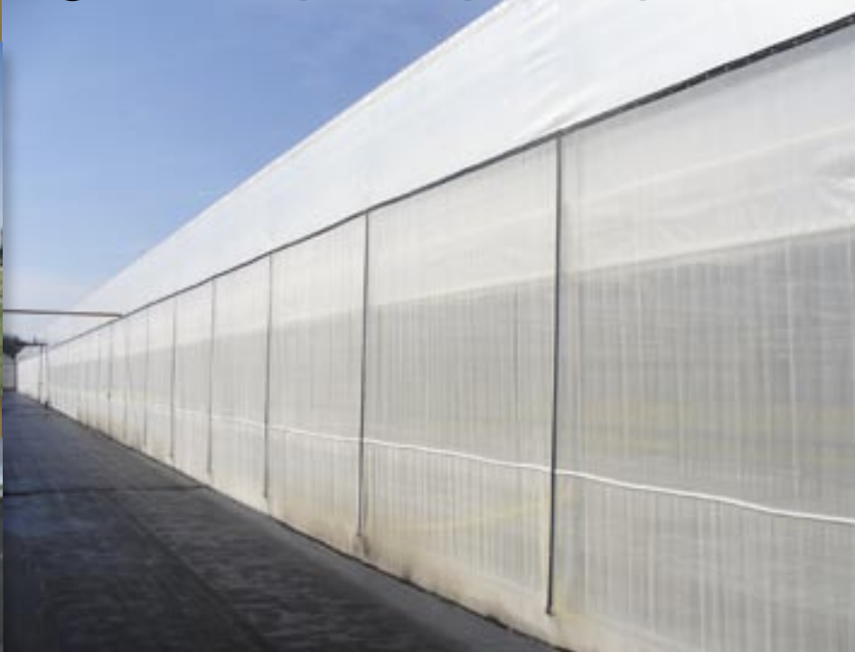
Side wall with roll up curtain and insect netting