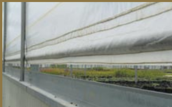
Positive seal using sealing flap on bottom edge of roll up curtain