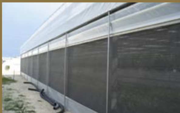
Sidewall with roll up, shade cloth and reinforced poly kneewall