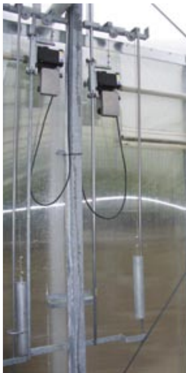
Gearmotor with counterweight for trouble free operation