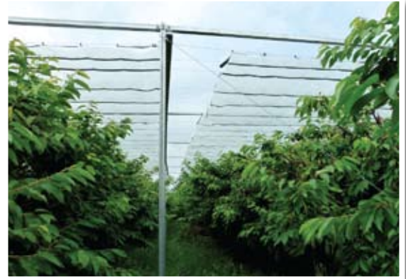
RETRACTABLE X FRAME